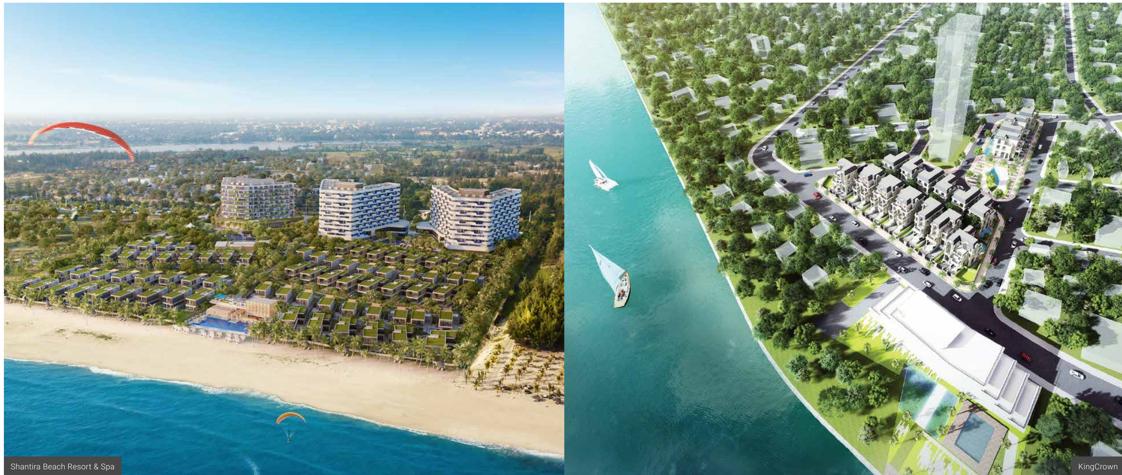
Shantira Beach Resort & Spa