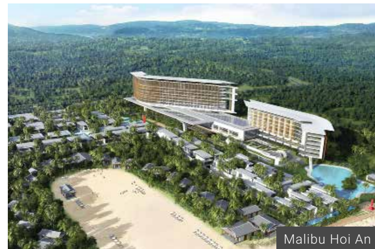
Malibu Hoi An